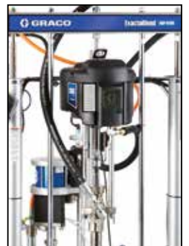
ExactaBlend AGP U100 for Urethanes